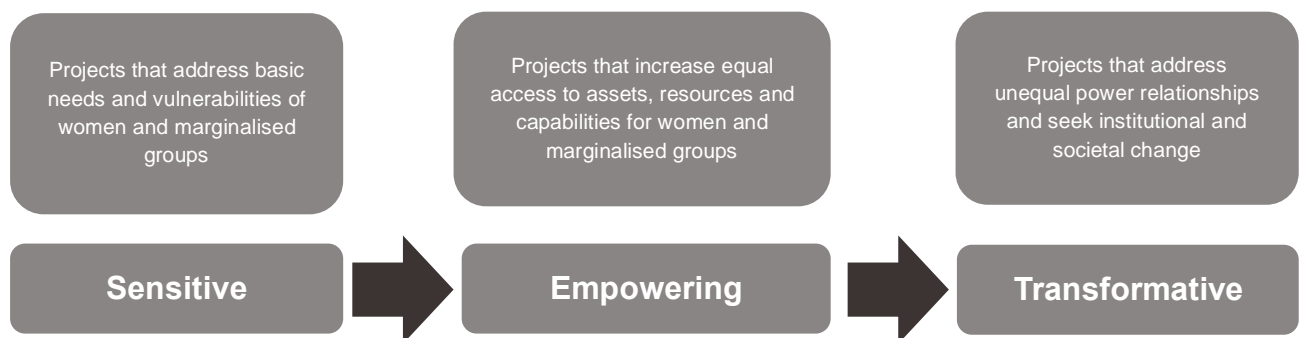
Figure 3: Definitions of the differing levels of GESI ambition

Projects that are able to demonstrate the integration of GESI considerations in their design and delivery plans, are likely to score more highly than those that cannot.